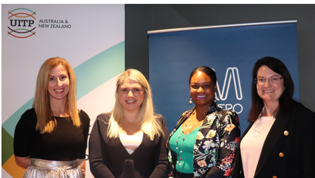
UITPANZ Women in Mobility Dinner, February 2020

Premium packages are usually reserved for transport authorities.