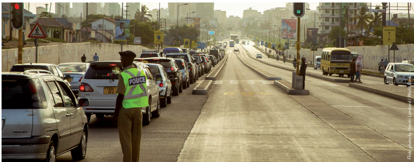
► Dar es Salaam’s

In addition, the question is to know whether the competencies of the PTA should be limited to Public Transport and Transport or become Mobility and, ultimately, Land Development Agency. Indeed, PTAs competencies evolves over time. Montreal in Canada is a good example. Montreal PTA’s undertook substantial reforms. Following UITP recommendations in terms of governance, ARTM decided to refocus its competences on the strategic and tactical level of decisions, leaving operational concerns to operators. Concurrently, it received new responsibilities related to planning and funding. The Metropolitan Plan of Development (PMAD) proposes the integration of