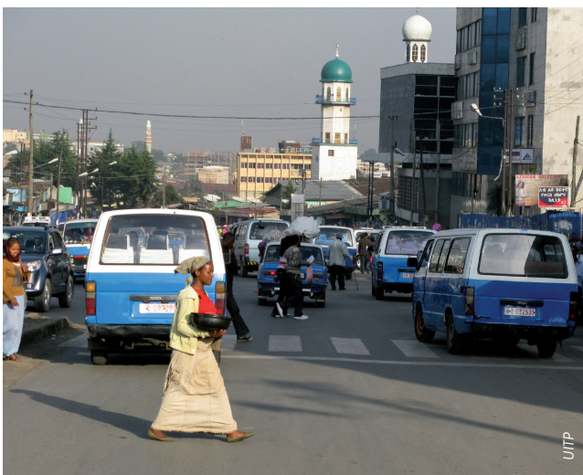
➤ Addis Ababa's

Transport Authorities should ensure that the establishment and continuous operation is underpinned by: the power to act, long-term planning, a strong partnership between a political champion and a dedicated technocrat, and a data-driven and evidence-based investment logic.