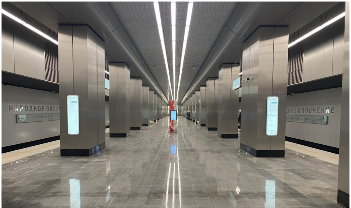
Narodnoe Opolchenie station

The decoration of the station is dedicated to the people's militia of 1612, 1812 and 1941. In the station lobbies and on the track walls there are thematic drawings made with the help of ultraviolet printing.