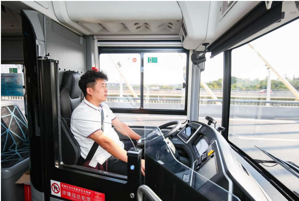
图：宇通 5G 智慧出行解决方案直播秀