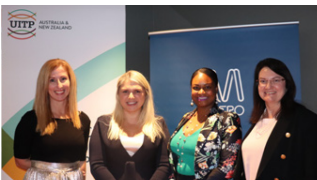
UITPANZ Women in Mobility Dinner, February 2020

Premium packages are usually reserved for transport authorities.