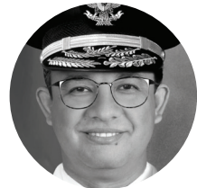
Anies Baswedan Jakarta Governor Chair of the UCLG Community of Practice on Mobility